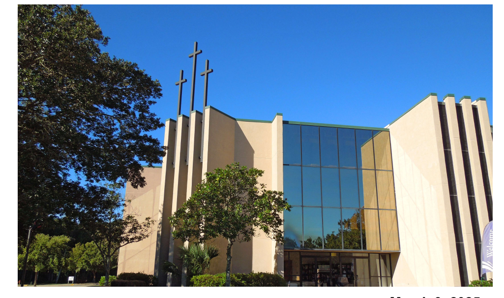
March 9, 2025